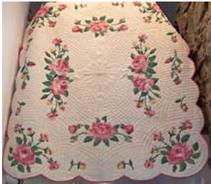
American Beauty Rose, appliqué kit quilt, circa 1945.