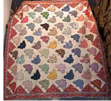
Butterflies using black buttonhole stitch.

placement as well as the quilting stitch lines. Some people think kit quilts took the creativity out of quilt making, but I think the appliqué kit quilt patterns provided a much needed “shot in the arm” to the craft. In addition we have a legacy of beautiful kit quilts that are more often than not exquisitely