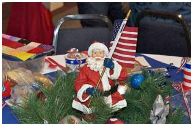
A patriotic Santa graces the Bee Sew Brave holiday table.