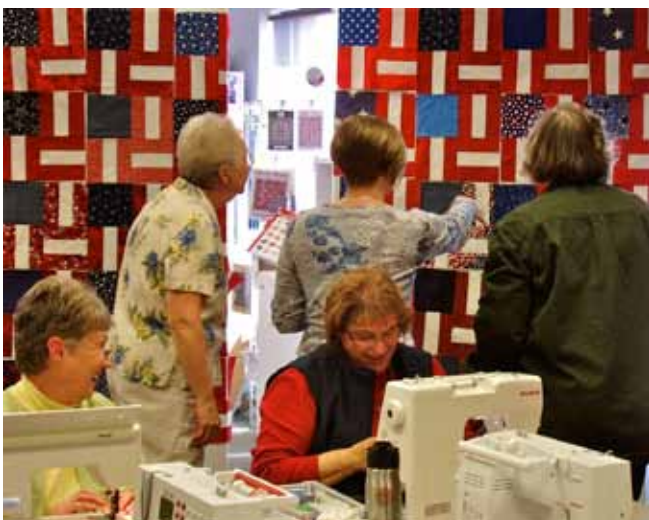
Bee Sew Brave hosted a sew day at the Presser Foot.