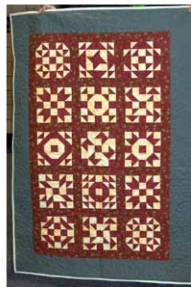
One of the 108 quilts made for Outreach.